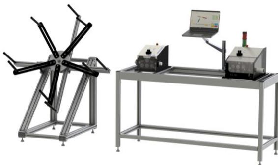
Swivelling winder "HA1000", external tube feeder "BV30" and "AC30" mounted on work table.