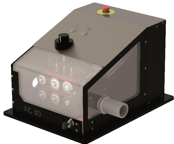
Tube Cutting Machine “AC30”

Numerous programs and program combinations (Sets) can be set. This make it possible to automate the cutting of different tube length in succession. Every tube length could be assign a technical drawing, work instruction, video or animated image and also an assembly time after every cut. By this the machine can guide thru an assembly installation.