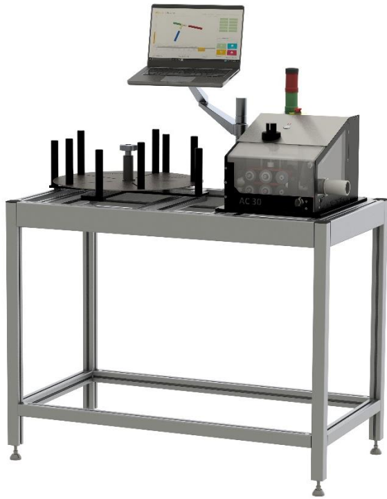
Winder "HA500" with "AC30" and Laptop on table.